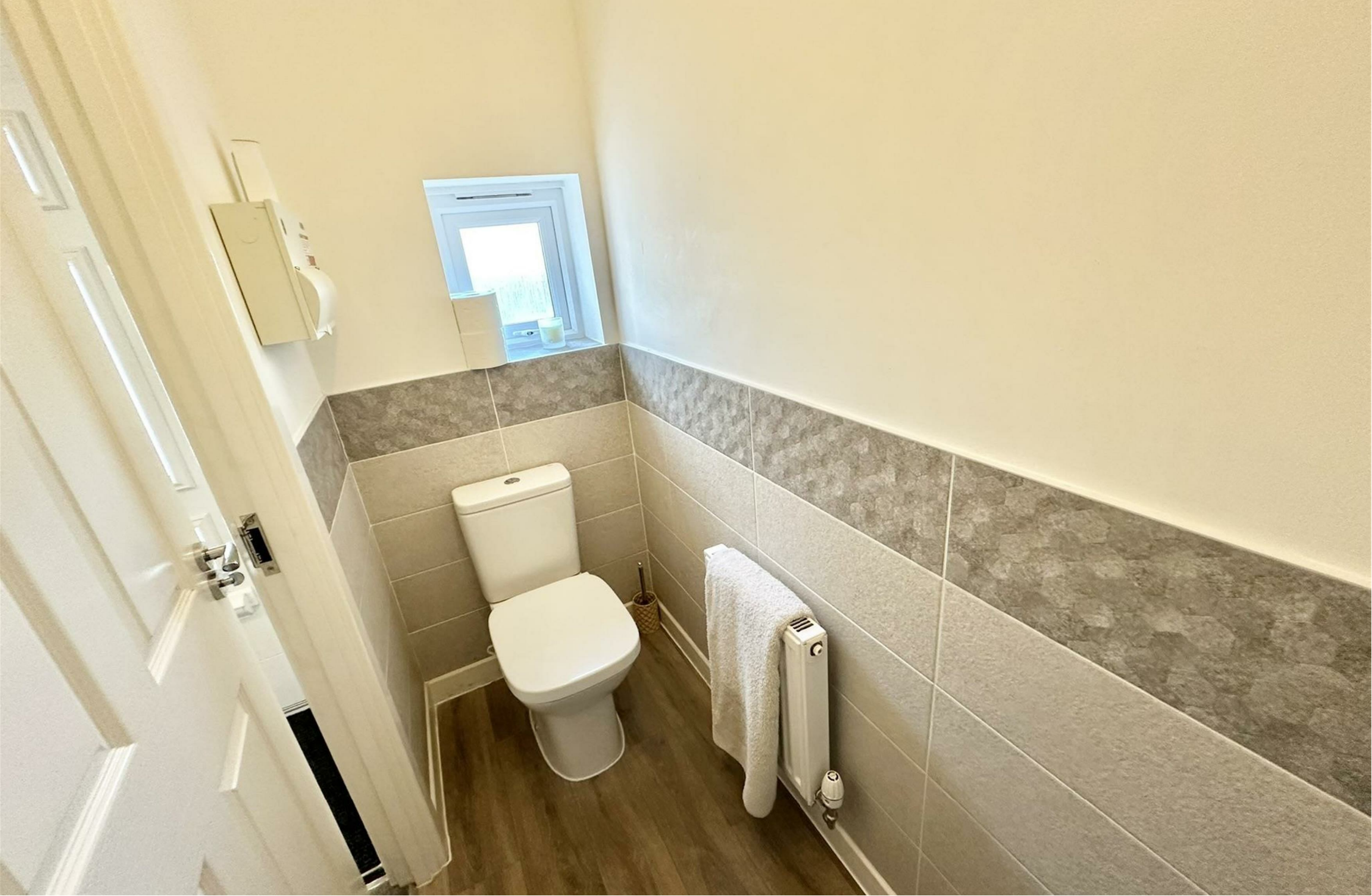
Quillet Close, St Austell, PL25 4GD